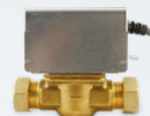
2 PORT ZONE VALVE