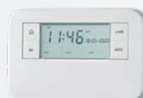
2/3 CHANNEL PROGRAMMER