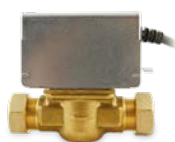
TWO PORT ZONE VALVE