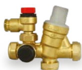
COLD WATER INLET SET