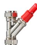
AUTO BYPASS VALVE