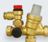
COLD WATER INLET SET

The complete package - each unit comes with: