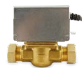
TWO PORT ZONE VALVE