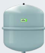
HEATING EXPANSION VESSEL